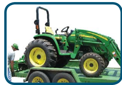
Thanks to John W. Speas and Effie E. Speas Memorial Trust-Bank of America, Trustee and all of the generous donors who helped with this effort.