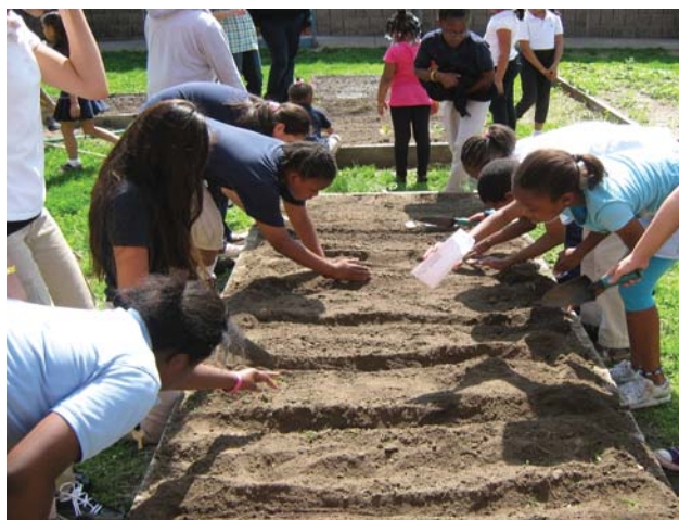
Crispus Attucks Elementary

for parents and friends to see. Cherry tomatoes and radishes were two of their favorite vegetables to harvest. The garden was built along a deck that provided a trellis to grow flowers and climbing plants behind the vegetables, and the school looks forward to planting gourds next season to use in art projects.