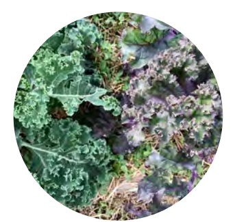
FULLY GROWN PLANT

Nutrition Facts : Kale and other cruciferous vegetables contain phytonutrients called glucosinolates . Glucosinolates help the body get rid of toxic or harmful substances and help cells stay healthy. Kale is also a great source of the vitamins A, C, and K as well as the mineral manganese.