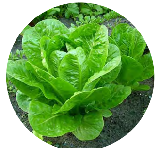
FULLY GROWN HEADS

Nutrition Facts: Different lettuce varieties contain varying amounts of nutrients, but one thing they all have in common is being a good source of fiber . Fiber is found in all plants and it can't be digested by humans. This might sound like a bad thing, but eating fiber actually helps your intestines stay clean and healthy!