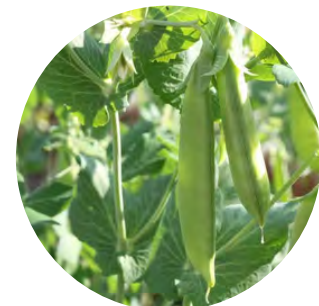
FULLY GROWN PLANTS

Nutrition Facts: Peas are a rich source of protein , which helps our muscles, hair, skin bones and nails stay strong and healthy. Peas are also an excellent source of vitamin K and C as well as manganese.