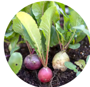
FULLY GROWN PLANTS

Nutrition Facts: Radishes are a good source of anthocyanins . Anthocyanins are phytonutrients and responsible for a red, purple and pink radishes color. These powerful nutrients are important for brain and heart health. Radishes are also great sources of vitamins C, folate, and B6 as well as the mineral potassium.