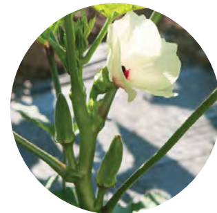
FULLY GROWN PLANT

Nutrition Facts: Okra is a great source of both calcium and magnesium . These two minerals are important for bone health as well as heart health. They work together in the body to keep bones strong and to help our heart have a healthy rhythm. Okra is also a good source of vitamin C.