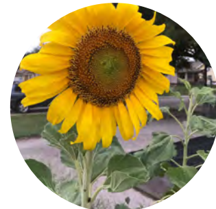
FULLY GROWN FLOWERS

Nutrition Facts: Sunflower seeds are a great source of vitamin E . Among other things, vitamin E is important for skin health and helps keep our skin smooth and feeling good. Sunflower seeds are also a good source of B vitamins including thiamine, B6 and folate as well as minerals like magnesium, manganese, copper, phosphorus and selenium.