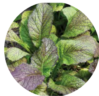
FULLY GROWN PLANTS

Nutrition Facts: Mustard Greens are a great source of vitamin A . Vitamin A among many other benefits, helps support healthy vision and skin. It also plays a very important role in helping our brain stay healthy so we can think and problem solve. Mustard Greens are also a good source of vitamins C, K, and folate as well as the mineral manganese and many phytonutrients.